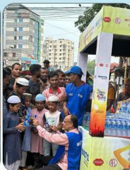
Heat Wave 2024