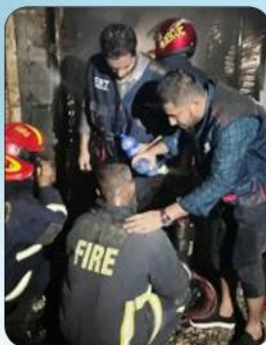
Fire at Bongobazar